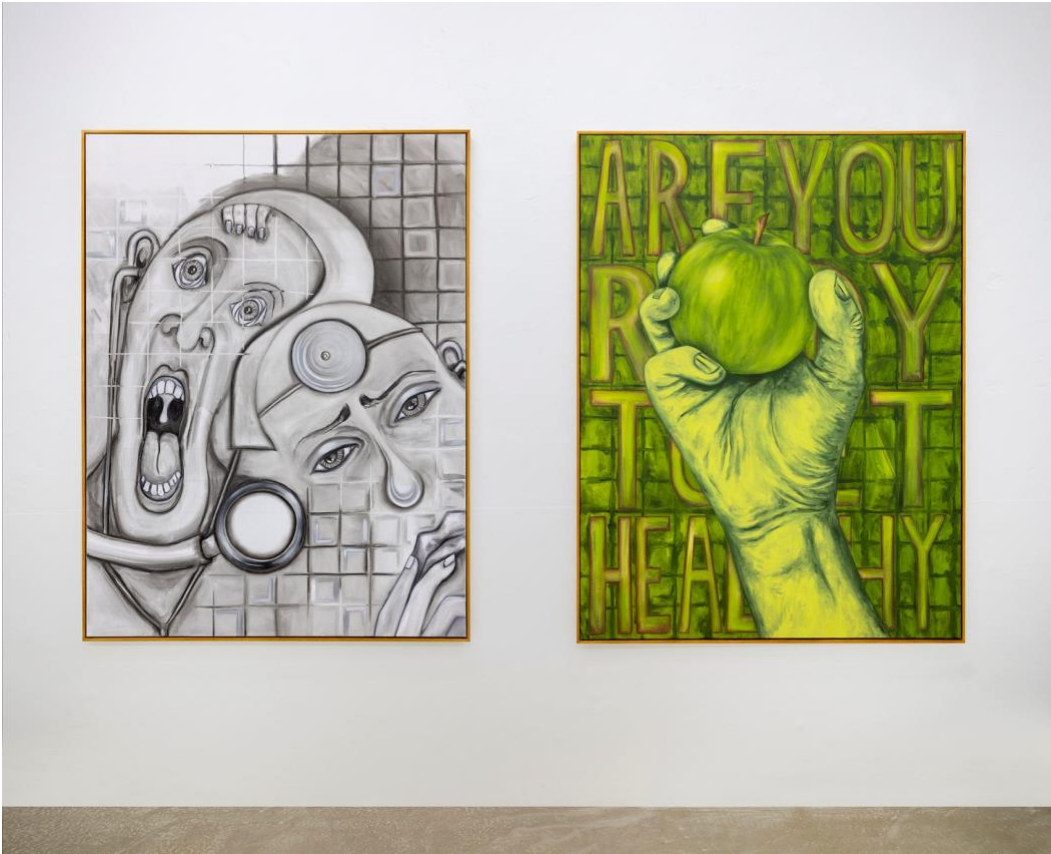
Tanja Nis-Hansen, impatient girl, 2023, exhibition view, palace enterprise, Copenhagen