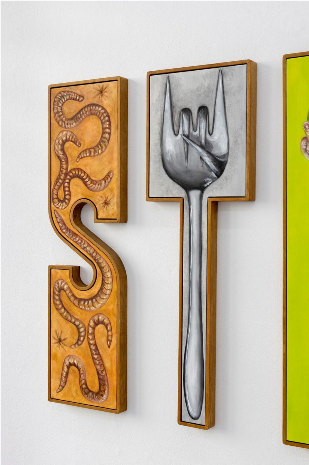
Tanja Nis-Hansen, STRETCHER, Stretch her! , 2023, Oil on canvas, oak frames, 100 x 320 cm