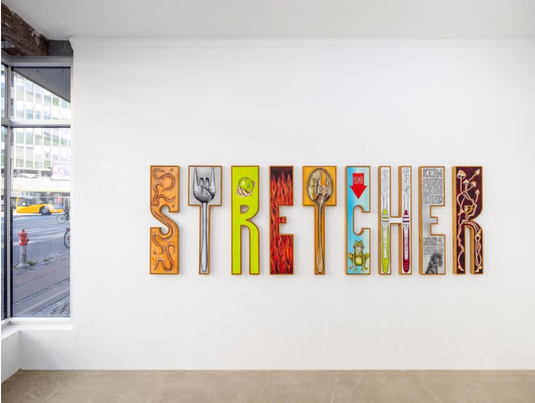
Tanja Nis-Hansen, STRETCHER, Stretch her!, 2023, Oil on canvas, oak frames, 100 x 320 cm