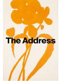
Tanja Nis-Hansen, Little-Miss-Fortune-Telling I, 2023, Tanja Nis-

Oil, acrylic and oil pastel on canvas, pine wood frame, 92.5 x 72.5 cm