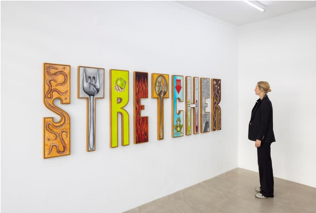
Tanja Nis-Hansen, STRETCHER , Stretch her!, 2023, Oil on canvas, oak frames, 100 x 320 cm